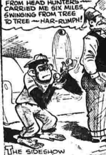
Still On The Roster!