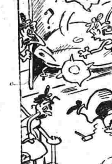
Grandma Wortle, who controls all the family money, lost her glasses just before the start of her favorite TV program