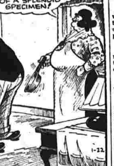
Let's Go, Boys! by V. T. Hamlin